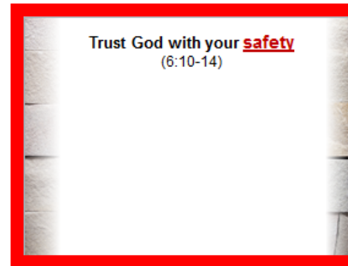
Trust God with our safety (6:10-14)

Now in verse 10 we find another ploy of God's enemies against Nehemiah, where we learn today that we must not only trust God with our priorities, but we must