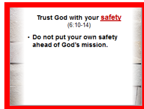
Never put your own safety ahead of God's mission.

Living as a Christ-follower requires risks. And all Christ-followers must come to the point where they realize that our earthly life here and now is not our most important possession!